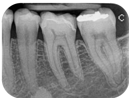
Delivers images in as little as five seconds.