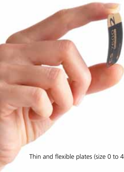
Thin and flexible plates (size 0 to 4).